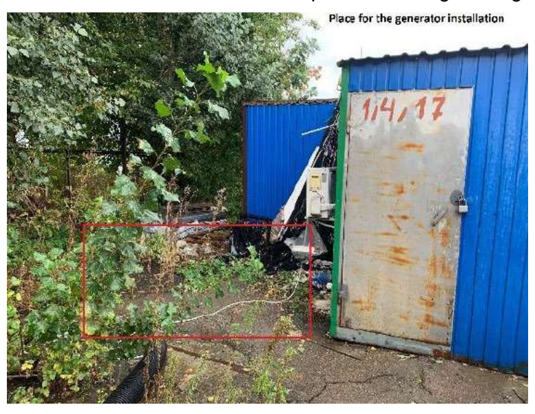
Latitude & Longitude: 50°29'25.3"N 30°29'26.8"E

2.8. Photos of site, items to be purchased, engineering construction plans (when available)