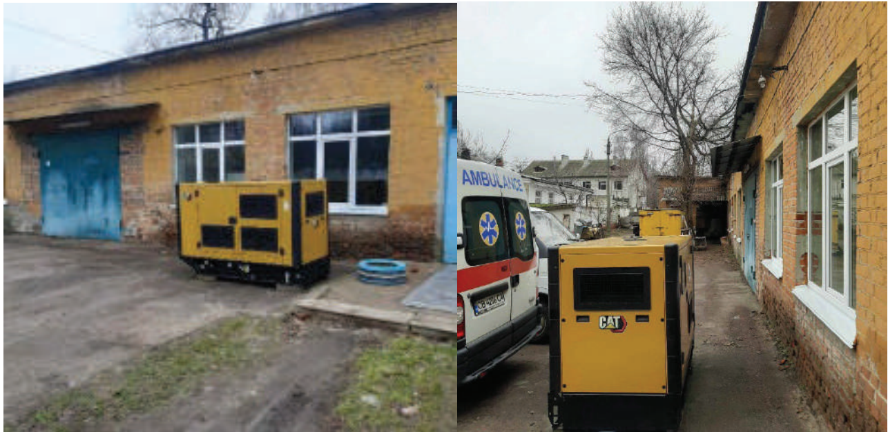
Photos of current onsite storage of the generator (located in the area where it will be installed). The generator has an integral fuel tank.